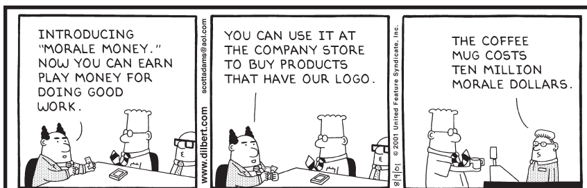
- Reprinted with permission from United Features Syndicate

Note: The first five people to correctly answer the riddle will win a free gift. Email, call or fax your answer (see form on back). Answer to last issue’s riddle: one thousand